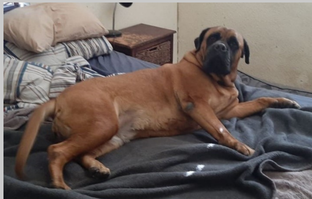
"Hey I am just waiting for your call"