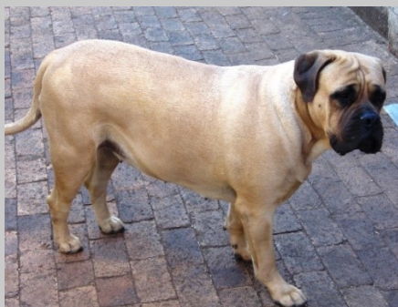
One of the lucky ones!

She will begin the next phase of training in the near future. We love Banshee dearly and consider ourselves fortunate to have her."