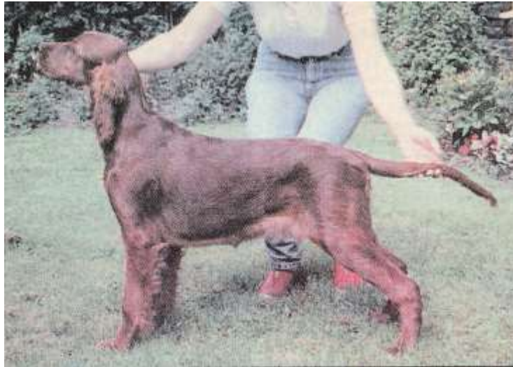
At five months Caspians Intrepid