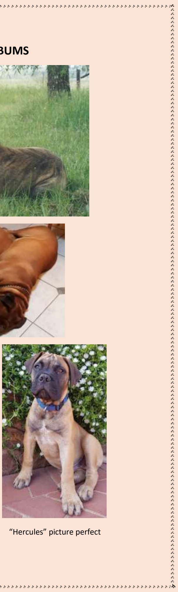
"Hercules" picture perfect